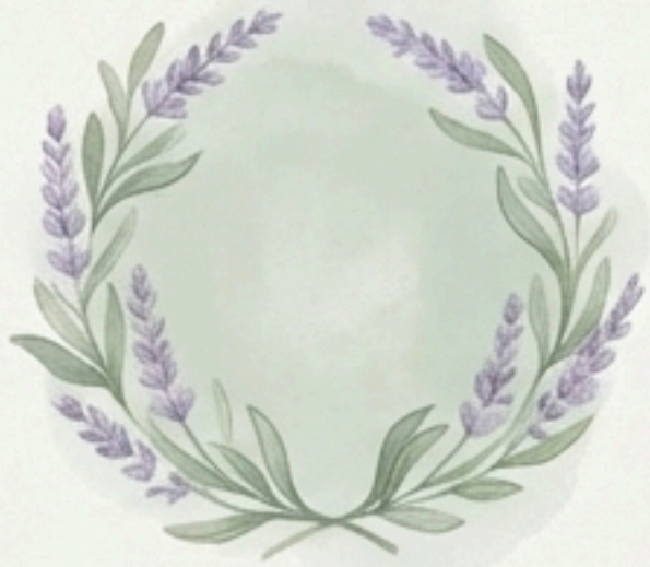
The Farewell Service