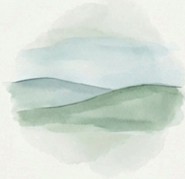
The Final Resting Place