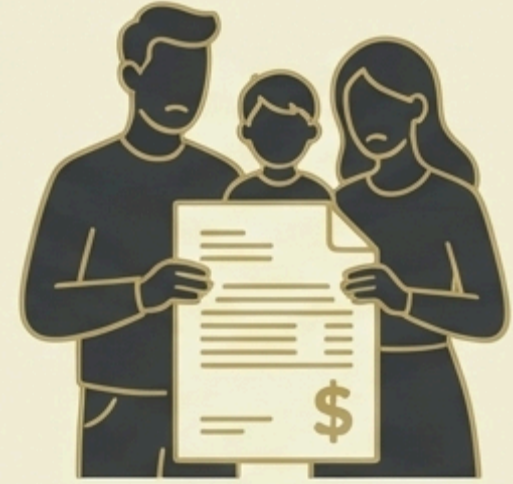
Immediate Funeral Costs